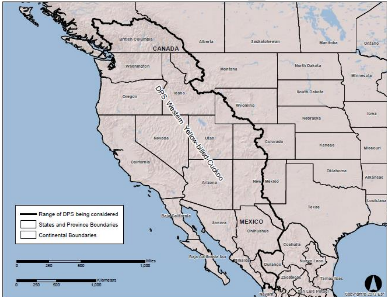
Figure 1. Range of the western Distinct Population Segment of the Yellow-billed Cuckoo.

Verde River, Gila River, Santa Cruz and San Pedro river watersheds, as well as multiple restoration sites along the lower Colorado River (Corman and Magill 2002, Halterman 2009, Johnson et al. 2010, McNeil et al. 2013). In New Mexico they breed on the Gila River and the middle Rio Grande (Stoleson and Finch 1998, Woodward et al. 2002, Ahlers and Moore 2012). In Colorado there are small numbers along the Colorado River and upper Rio Grande (Beason 2010). There are no known breeding populations in Oregon (Marshall et al. 2003). In Idaho there is reported breeding on the Snake River (Cavallaro 2011). In Nevada they may occasionally breed on the Carson, Virgin and Muddy Rivers (Halterman 2001, McKernan and Braden 2002, Tomlinson 2010, McNeil et al. 2013).